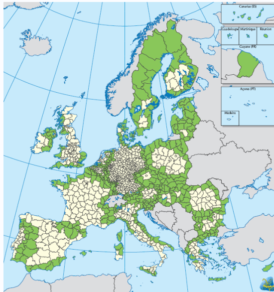
Areas for Crossborder Cooperation 2007-2013