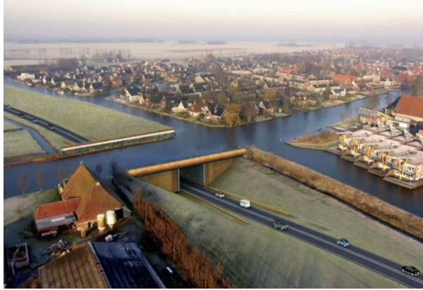
Artist impression aquaduct Woudsend